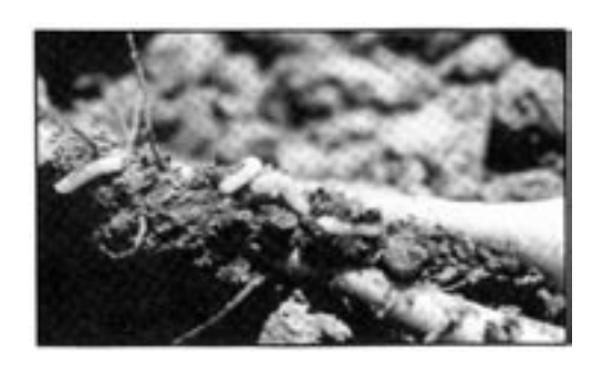
Larva of SUGAR BEET ROOT MAGGOT , Tetanops myopaeformis , see color print, Fig. 17A, on publication B-1013.

Mouthparts: Rasping in larvae and sponging in adults