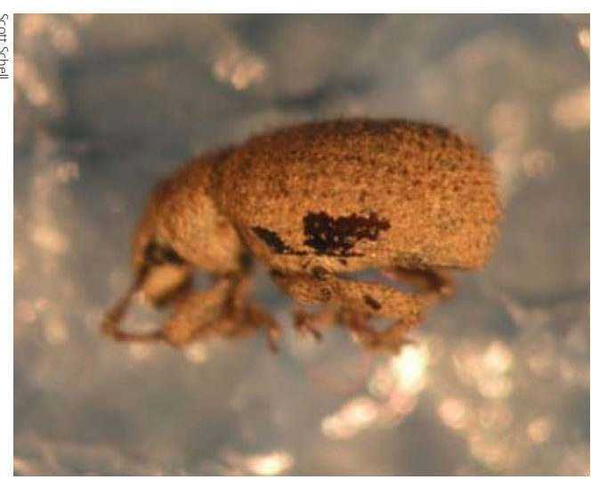
Photo 8. Strawberry root weevil with a thin coating of dirt flaking

night and hide in soil litter during the day. Then females start to lay eggs in the soil near the base of host plants. Each BVW can lay 200 to 500 eggs during the summer. The eggs hatch in 10 to 15 days into C-shaped, wrinkled, cream-white larvae with brown head capsules. The larvae are legless (Photo 9), which distinguishes them from turf pests like white grubs of chafers and June beetles (Photo 10).