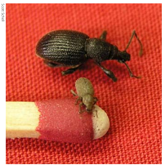
Photo 6. Black vine weevil and strawberry root weevil and a kitchen match for scale