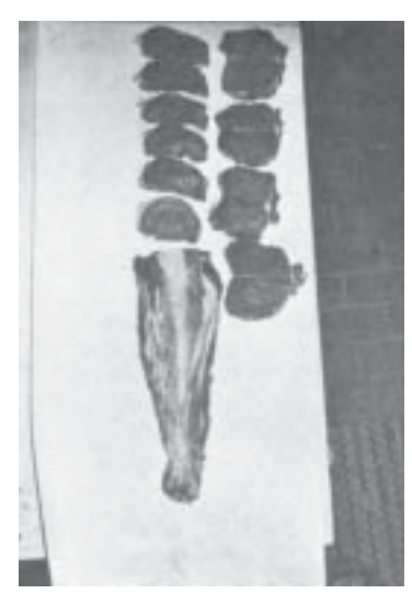
Fig. 10. Make individual steaks (left) or butterfly steaks (right).

The remaining muscle to which the tendon is attached is a heel of round roast. This roast is generally quite tough and can best be utilized in ground game or sausage. When it is removed, the skeleton will fall, so make sure that all remaining edible meat is trimmed first ( Figure 18 ).