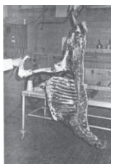
Fig. 18. Trimmed skeleton with one tendon left intact to hang the carcass.

The University of Wyoming is an equal opportunity/ affirmative action institution.