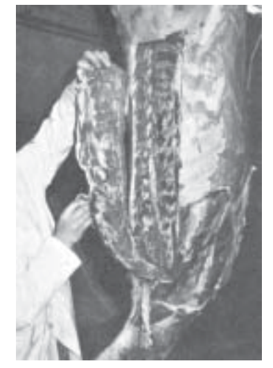
Fig. 8. Cut close to the bone.