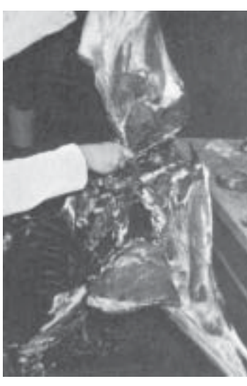
Fig. 16. Remove the top round at the seam.

Consult the following publications for more information: You and Your Wild Game , B-613R; Nutritional Content of Game Meat , B-920; The Pronghorn Antelope Carcass , B-565R; The Mule Deer Carcass , B-589R; The Elk Carcass , B-594R; Deer and Antelope Yield , AS-102; and Aging Big Game , B-513R. To obtain these publications, phone the UW CES Resource Center at 307-766-2115 or go online at www.uwyo.edu/ces/ansci.htm to view the bulletins free of charge.