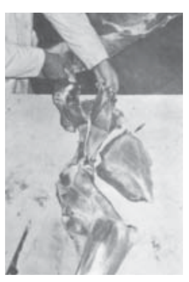
Fig. 6. Blade roasts are removed.