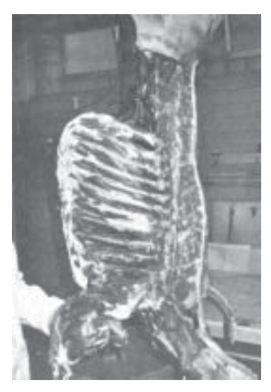
Fig. 12. Contamination on the inside can be avoided.