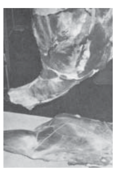
Fig. 5. The line shows where the boneless shoulder roast is removed.