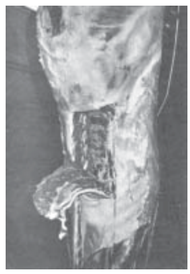
Fig. 7. Cut next to the hipbone and down the back.