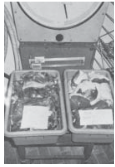
Fig. 19. Cuts and lean trim.