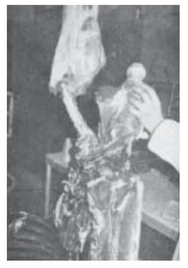
Fig. 17. Remove the rest of the muscles from the femur.