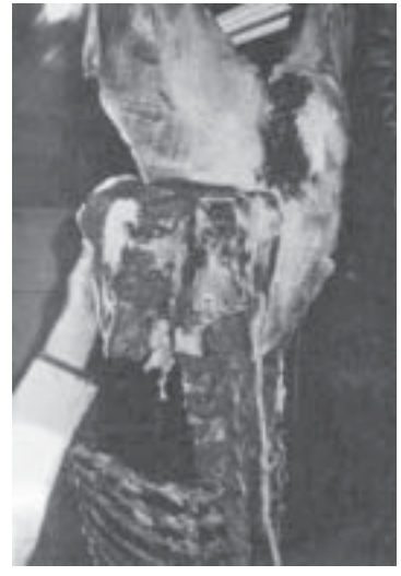
Fig. 15. The sirloin butt is removed.