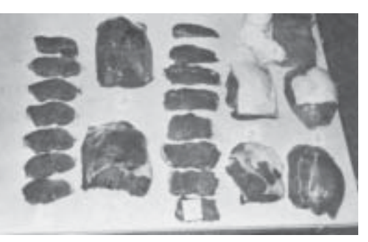
Fig. 20. Cuts from the round.