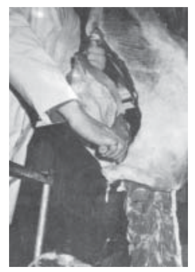
Fig. 13. The sirloin tip is removed.