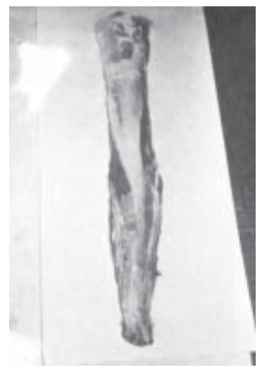
Fig. 9. Trim fat and connective tissue.