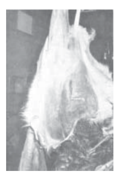
Fig. 1. Pull the skin back away from the meat.

When the skin is pulled down to the shoulders, put the tip of the knife under the skin and make a cut along the rear of the front legs. Skin the legs ( Figure 3 ) and then pull the skin down the neck to the head and remove the head at the atlas joint (first joint).