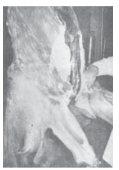
Fig. 3. Make a cut down the front legs and skin the legs.