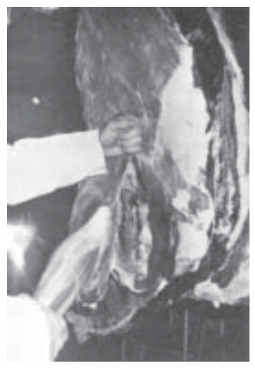
Fig. 4. Remove the shoulder.

Trim excess fat and connective tissue from the muscle and make individual or butterfly steaks ( Figures 9 and 10). Cut next to the ribs to remove the remainder of the meat from the forequarter ( Figure 11 ) and use it for ground game, stew meat, or sausage. To reduce microbial growth, freeze the trimmings along with the steaks and roasts the day they are removed from a carcass. If necessary, frozen trimming can be thawed in a refrigerator or in plastic bags submerged in cold water and processed at a later date.