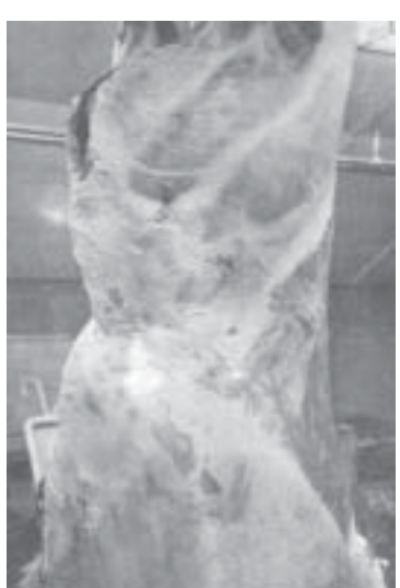
Fig 2. Pull the skin from the back after skinning the sides.