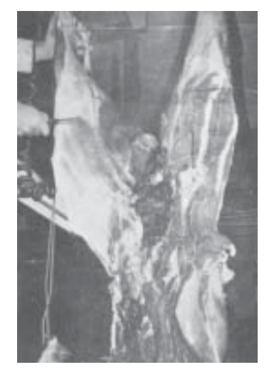
Fig. 14. The front of the femur is exposed.