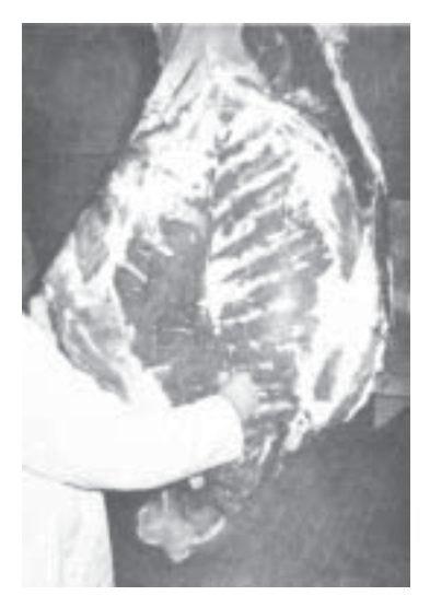
Fig. 11. Cut next to the ribs.