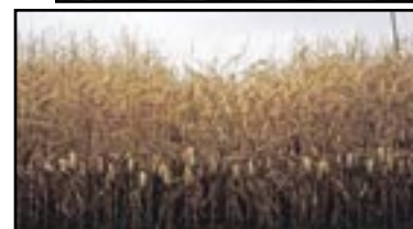
Irregular areas are due to decreased wetted diameter of in-canopy sprinklers. Years of above normal precipitation will mask poor water distribution, but crop yields suffer in years with below normal precipitation.