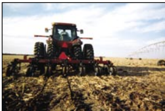
No-till ripper post harvest. Ripping is most effective in dry soils.