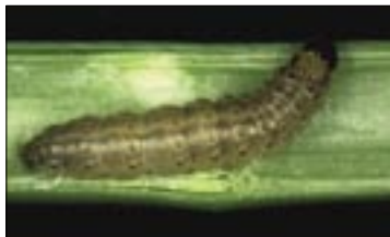
European corn borer larvae feeding on a corn stalk.

It is critical for growers to know which hybrids are conventional, approved for EU export, or not yet approved for EU export. Growers should take seed company grower agreements seriously and be aware of the requirements of those agreements before planting.