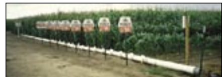
Planting hybrids with different maturities ensures further genetic diversity in the crop, which can minimize certain pest problems or environmental stresses for which no specific resistance or tolerance is available. Such diversity may also downgrade losses from drought, heat, and green snap.

Specific-Trait Corn – includes blue, white, high-oil, waxy, high-amylose and other corns used in the production of food products such as corn bread and tortillas. These corn hybrids are grown for their specific milling, baking or nutritional characteristics.