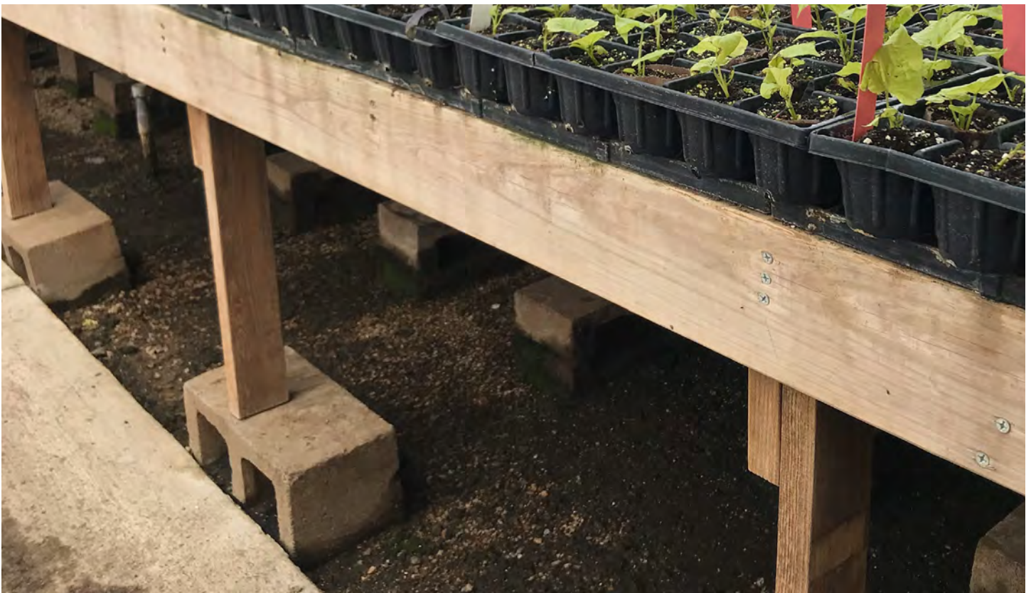
Benches can be made from inexpensive wood and cinder block.

Accessory equipment can include potting areas, storage for pots, growing media, fertilizers, and any watering or spray equipment needed. It is best to keep these in a separate area outside of a greenhouse in order to keep all usable space inside available for growing plants.