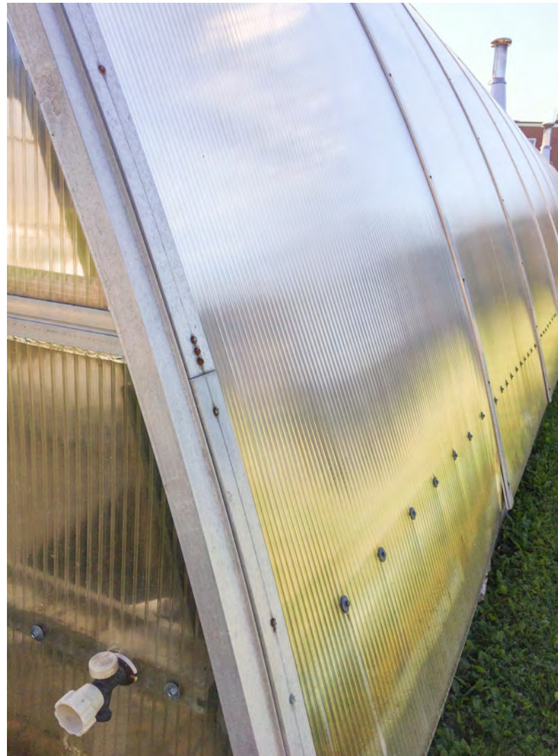
Greenhouses are available in many different shapes, sizes, and structural materials.

A free-standing greenhouse can be located away from existing buildings. Plants in a free-standing greenhouse receive light from all directions. These greenhouses are more expensive to build and heat, and extra expense is required to run water and electrical lines to them. Any