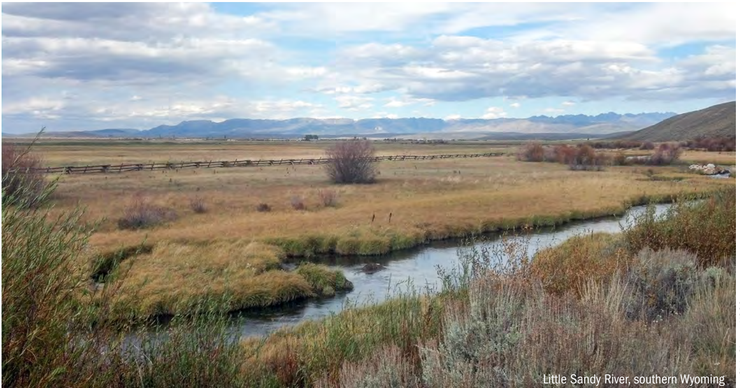
Little Sandy River, southern Wyoming