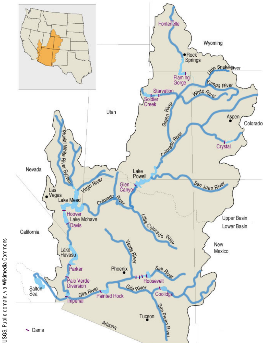
Figure 1. The Colorado River Basin