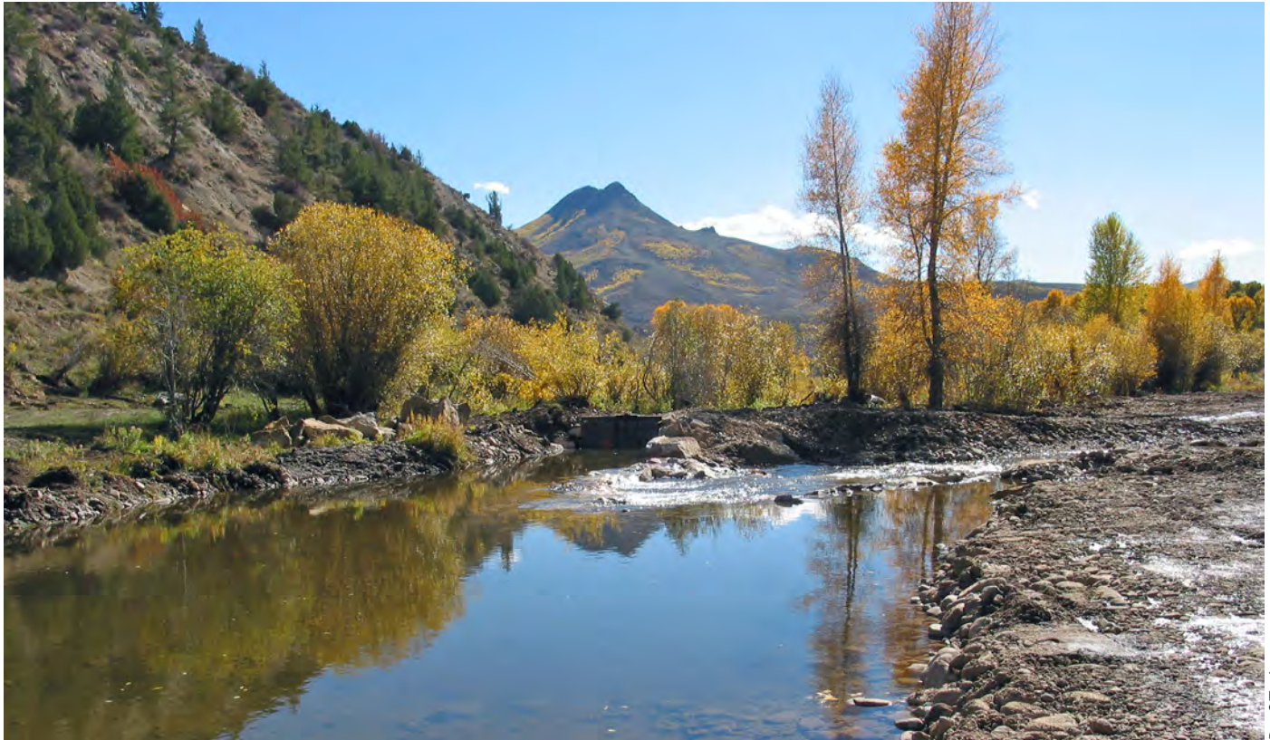
Battle Creek, Little Snake River Valley

River Basin accounts for 8 percent of consumptive water use in the Wyoming CRB and 7 percent of its agricultural water use. The two largest trans-basin diversions are from the Green River Basin to the Bear River Basin and from the Little Snake River Basin to the City of Cheyenne.