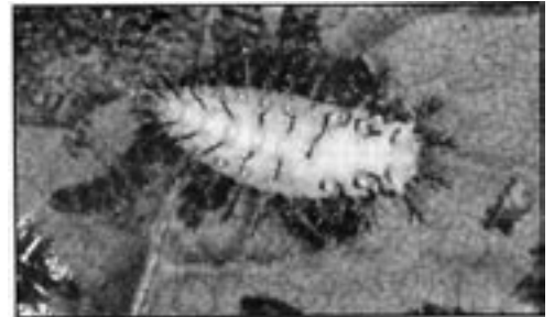
Larva of the MEXICAN BEAN BEETLE , Epilachna varivestis , see color print, Fig. 20A, on publication B-1013.

Mexican bean beetles (leaf-feeding coccinellids) were first detected in the United States in the late 1800s. They have spread throughout the western region of the United States, damaging dry beans, okra, eggplant, alfalfa, and clover.