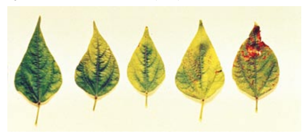
Courtesy H.F. Schwartz. Reprinted with permission from Nutrient Deficiencies and Toxicities of Plants, 2000, The American Phytopathological Society, St. Paul, MN.

Figure 2. Visual indications of zinc deficiency in dry bean leaves.