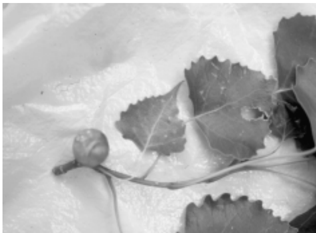
Figure 4. Plant responses to aphid feeding. Stem gall on cottonwood caused by Pemphigus spp. gall aphids.

Several non-insecticidal methods of control can reduce aphid populations. For aphids that produce galls, gall removal can be an effective control measure. Re-