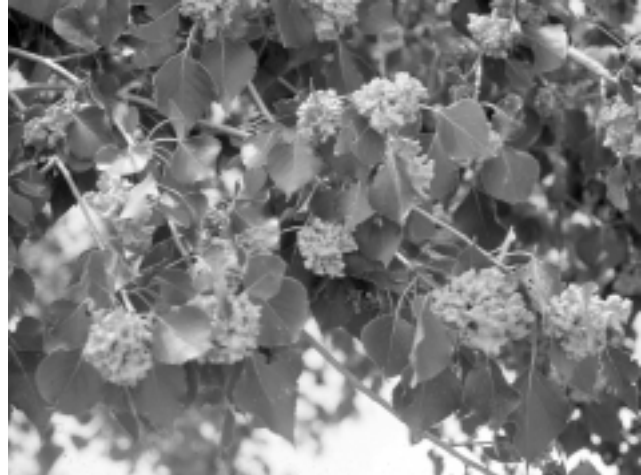
Figure 5. Plant responses to aphid feeding. Leaf galls on cottonwood caused by Poplar vagabond aphid.

Some other types of arthropods (insects and eriophyid mites) induce gall formation. Generally, plant health effects and management considerations are similar to those of gall-forming aphids. Often the insect is identified by the characteristic