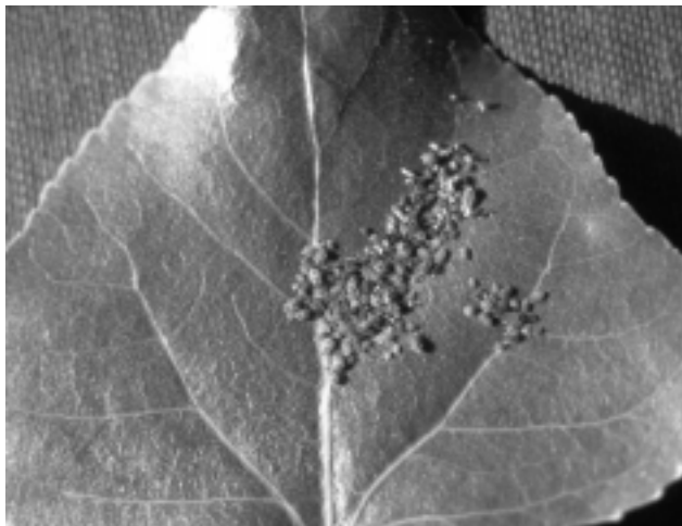
Figure 2. Plant responses to aphid feeding. Spotty discoloration with aphids.

Commonly in this region and for most species of aphids, only female aphids occur during the spring and summer. They reproduce asexually and give birth to live young. Both winged and wingless females may be produced. The formation of winged individuals may be triggered by changes in host quality, day length, or other environmental cues. Young will mature to adults in about 10 to 14 days depending upon weather; therefore, multiple generations will occur during the growing season. During the growing season aphids feed on annual plants and new growth (expanding leaves and stems) of perennial trees and shrubs. Some aphids, such as the green peach aphid, thrive on