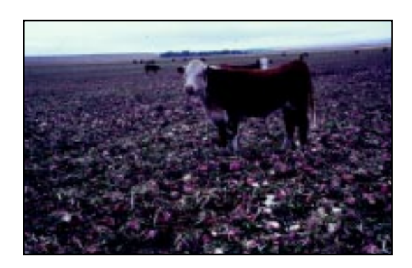
Yearlings grazing turnips on irrigated center pivot circle at Bill Gross Farm, Pine Bluffs, WY, October.

in prepared seedbeds than with no-till seedings of brassicas into sod. Stocking rates as high as 1600 to 2200 lamb grazing days per acre or five to nine animal-unit months (AUMs)