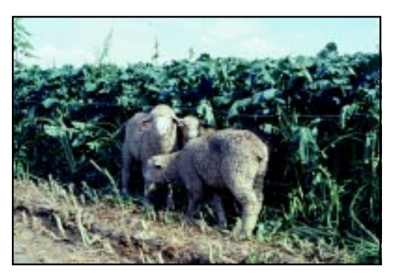
Lambs grazing in the fall on July-planted "Emerald" rape. Powell Research and Extension Center.

Mixed species seedings have improved animal performance over straight brassicas. Oats or other small grain can be seeded with brassicas. These