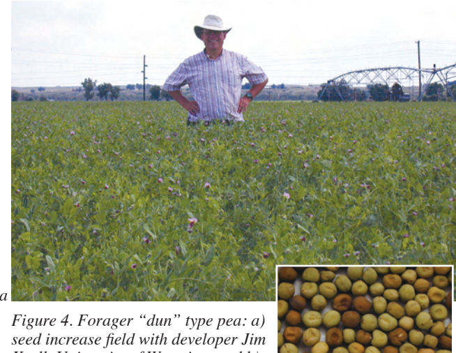
Krall, University of Wyoming, and b) "dun" type seed with coin.

Recently the University of Wyoming and the University of Nebraska-Lincoln jointly released a "dun" type spring pea named "Forager" (Figure 4). In addition to excellent biomass, production trials reveal that it has good grain production potential; however, as a "dun" pea, it has a greenish/brown seed coat that disqualifies it from the USDA yellow or green grain marketing classes. At this time, attempted sale of this pea into the grain market is not recommended. It will be classified into the miscellaneous class at a discount.