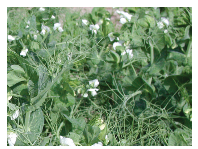
Figure 2. Semi-leafless type pea with white flowers.

maturity, unless planted with a small grain. The other type is semi-leafless, which has modified leaflets reduced to tendrils ( Figure 2 ). This type has more tendrils and shorter vine lengths of two to four feet, which gives semi-leafless types better standability at harvest.