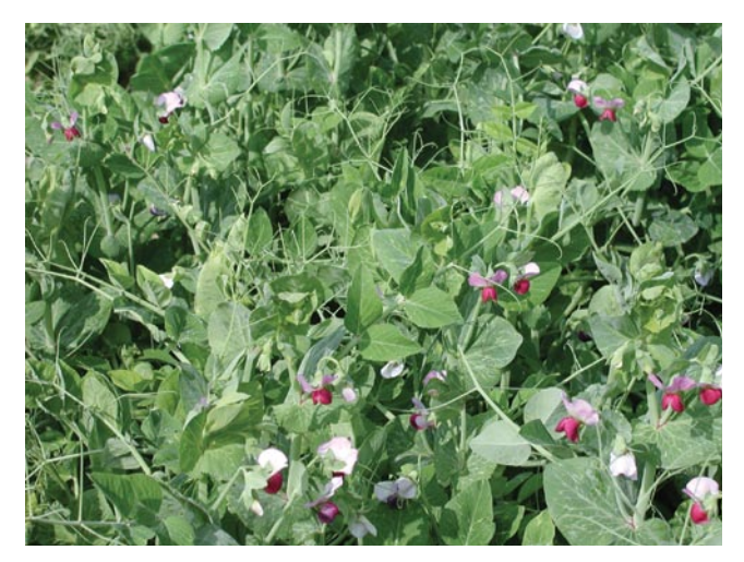
Figure 1. Normal leaf type pea with blue flowers.

Pea is an annual cool-season legume that grows best when average daily temperatures are 55-65°F. Pea plants range in height from two to five feet. Leaves consist of up to three pairs of leaflets with a terminal tendril. Tendrils are modified plant parts that coil around objects and help support and elevate the plant.