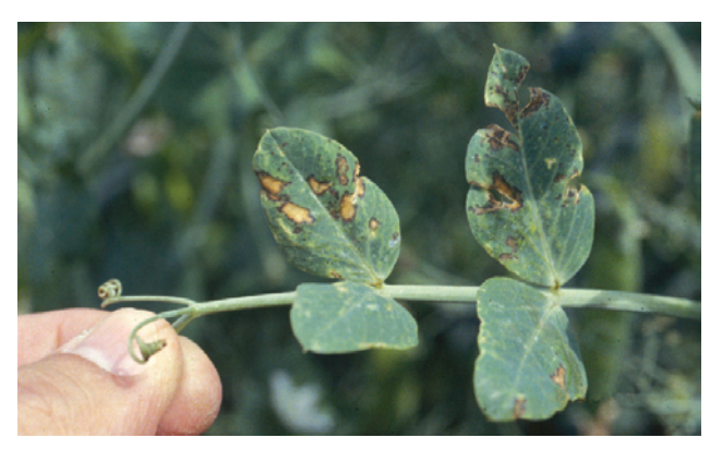
Figure 6. Bacterial blight on pea leaves.

Bacterial blight, caused by Psuedomonas syringae pv. pisi , is commonly found throughout the High Plains, but incidence and damage is generally low ( Figure 6 ). It can be destructive during periods of cool, damp weather, particularly if the crop was previously damaged by hailstorms. The pathogen is often seedborne, which directly infects young seedlings. The bacterium can also live on various weed species and other plants and can spread to neighboring, healthy plants through wounds and rain splashes during storms.