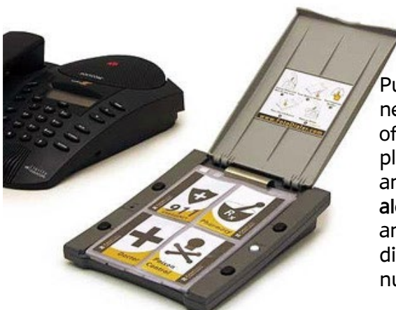
Foto Dialer Telephone Companion

Push the button next to the photo of the person or place to be called and the FotoDialer, connected to an existing phone, dials the phone number.