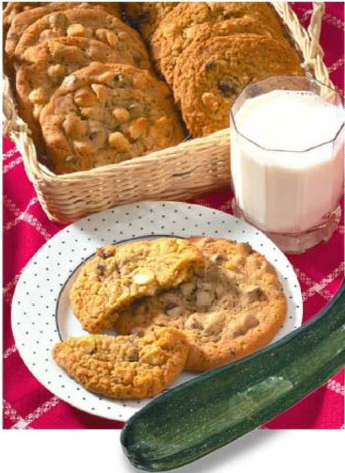
cakes & cookies