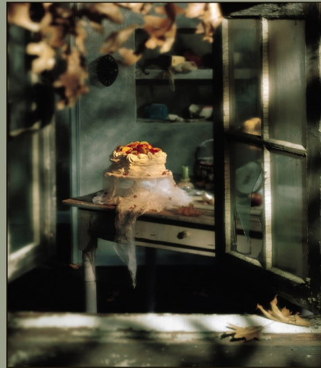
A Collection of Recipes and Memories