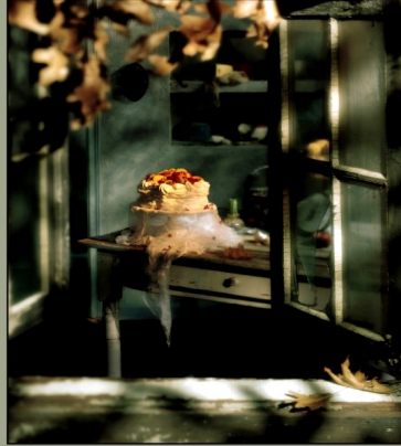
A Collection of Recipes and Memories