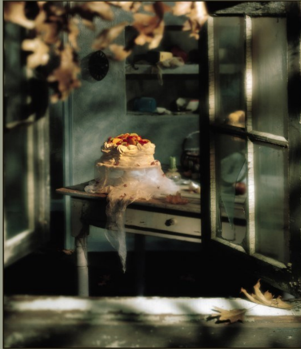
A Collection of Recipes and Memories