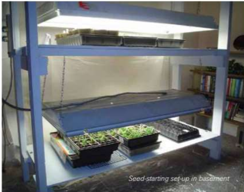
Seed-starting set-up in basement

Seeds. Flipping through a seed catalog (or browsing an Internet site) in January is definitely a boost to the spirits during cabin fever season. As you shop for seed, note the numbers given for days to maturity for vegetable varieties and make sure they work with the number of frost-free days in your area. Sometimes days to maturity is based on the seed germination or on the transplant date. Make sure your calculations are accurate. Be wary of over-the-top claims for plant performance and keep your expectations realistic. Seed left from a previous year can be used – different types of seed will germinate for a number of years – some only up to one year – others up to five years or longer; store seeds in a cool, dry place. If you go overboard on ordering seeds, simply tuck a few packets away for next year.