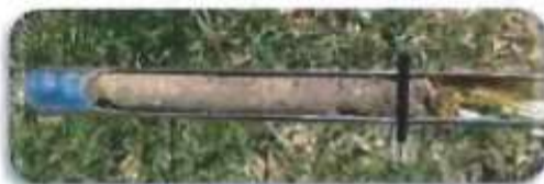
Figure 1. Soil sample core, discard portion to the right of the black line.