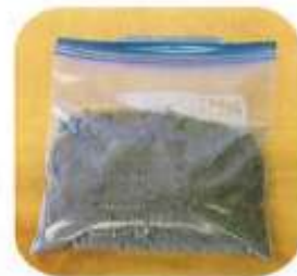
Figure 3. Soil sample ready for shipping.

When in doubt on how to sample – check the lab's directions for sampling and submission, they usually provide them online.