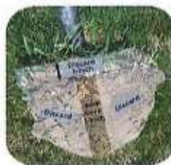
Figure 2. Soil sample with a shovel or trowel. The sample is the middle inch of soil, discard top inch and side portions of soil.