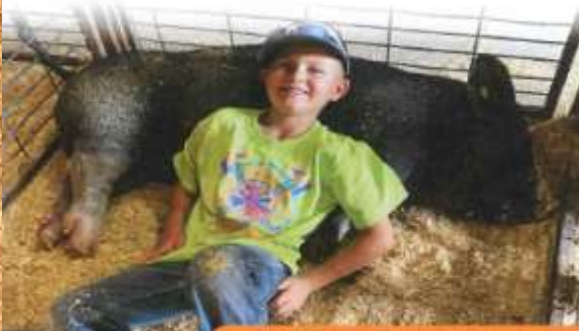
2022 Fair to Fork participants

You could say we're going whole hog in the fight against food insecurity in Wyoming!